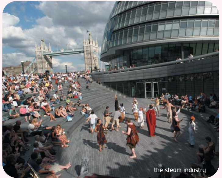
the steam industry

The Theatre Museum's Education Department offers a wide range of workshops, skills sessions and resources for schools exploring everything from scriptwriting to stage make-up. STEP is offering eight schools the chance to visit the museum for FREE and participate in a 90-minute session, which includes an overview of the museum's galleries and a costume and make-up workshop.